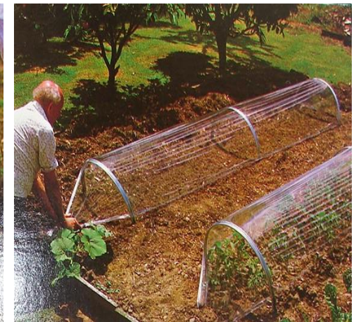
Stretch the cover firmly