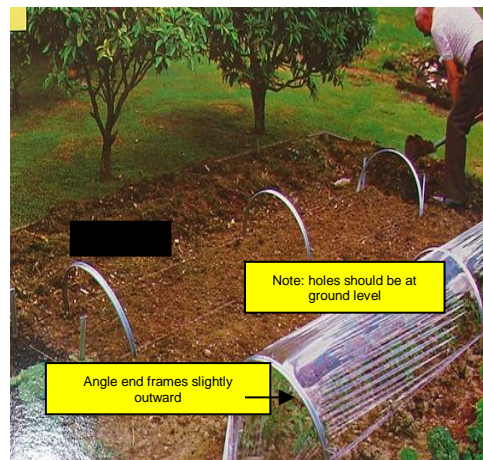
Push the frames into the ground. Dig 150mm deep holes at each end of the bed