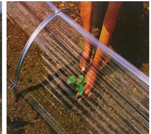
There is easy access for planting, watering and crop tending.