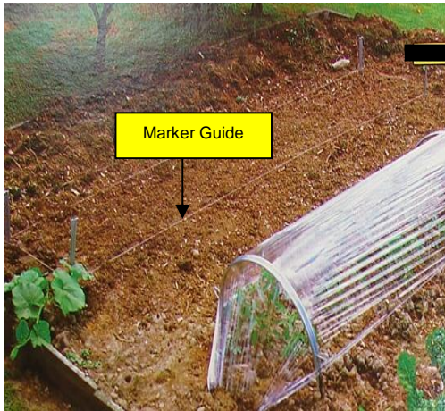
Prepare and cultivate bed. → Place marker lines as a guide.

NOTE: Loose or sandy soil may require the frames to be anchored by pins or concrete. High wind areas will require the frames to be placed closer together and the covering buried or held down with weights along its' sides. When not in use – remove the frames from the ground to help prevent corrosion.