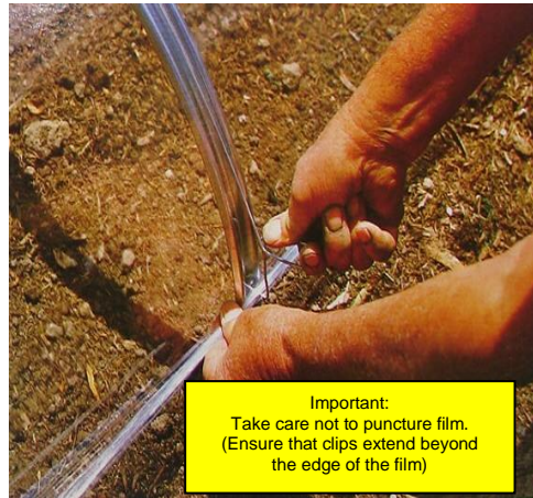
Secure the cover in place by locating the wire clips into the frame holes.