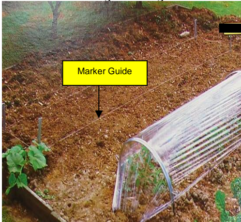
Prepare and cultivate bed. Place marker lines as a guide.

NOTE: Loose or sandy soil may require the frames to be anchored by pins or concrete. High wind areas will require the frames to be placed closer together and the covering buried or held down with weights along its' sides. When not in use – remove the frames from the ground to help prevent corrosion.