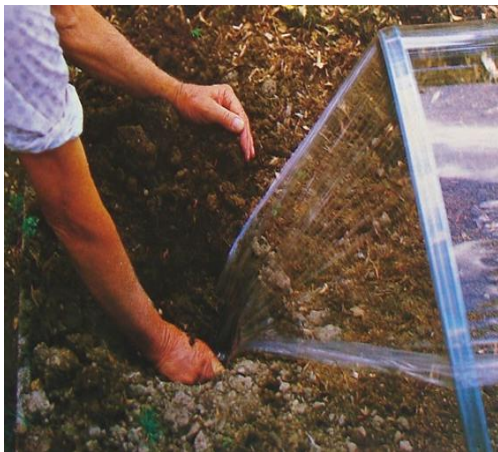
Bury the second end