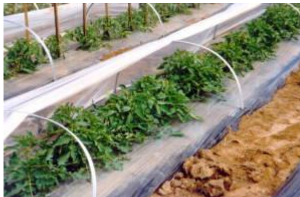
Cloche over mulch film

Plastic film is not supplied with cloche frames unless stated