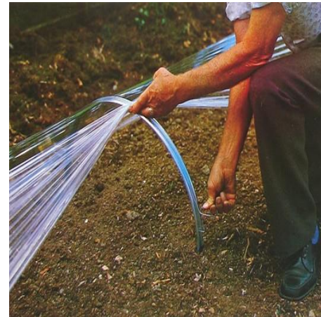
Exclusive adjustable clips ensure that the cover stays where you want it.